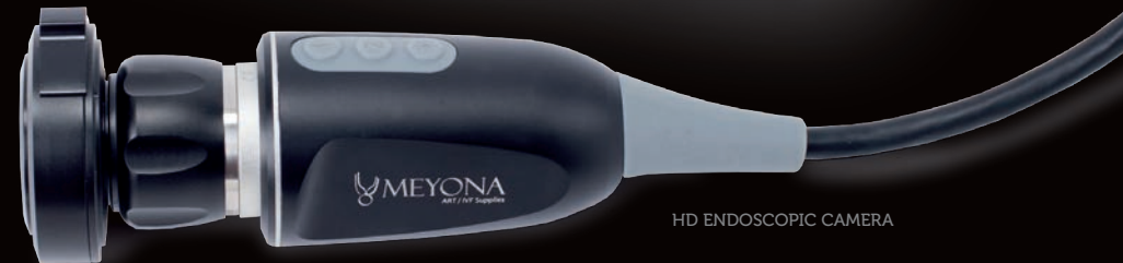
HD ENDOSCOPIC CAMERA