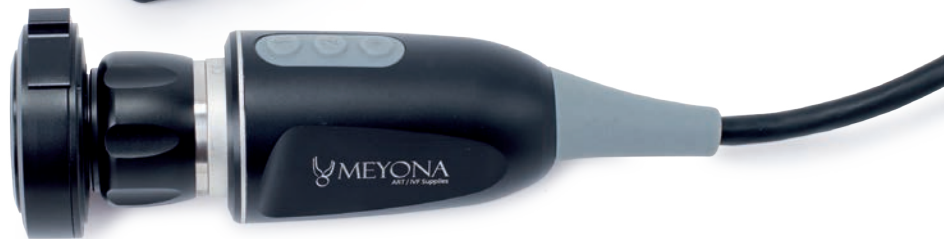
HD ENDOSCOPIC CAMERA