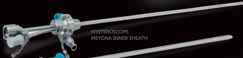
HYSTEROSCOPE MEYONA INNER SHEATH