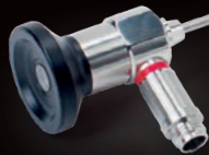
OPTIC RIGID 30°