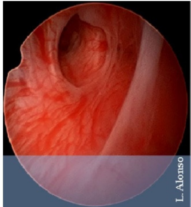
Detailed view of the defect

The new edition of the Hysteroscopy Newsletter is now available attached!